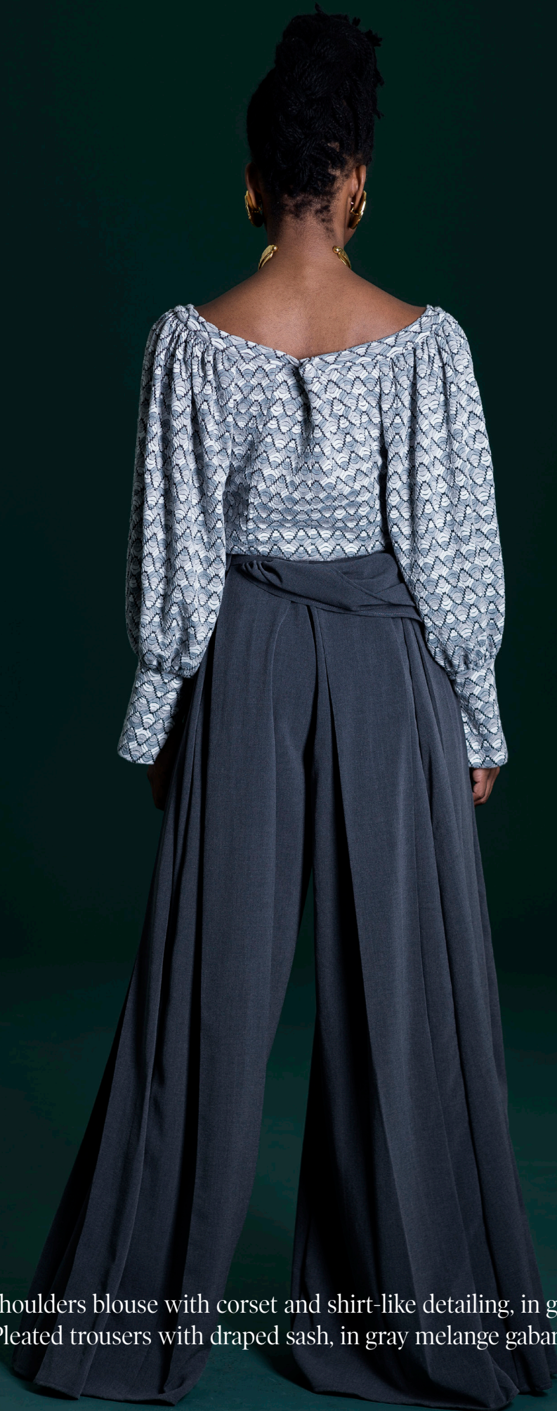
Off-the-shoulders blouse with corset and shirt-like detailing, in grayscale knit. Pleated trousers with draped sash, in gray melange gabardine.