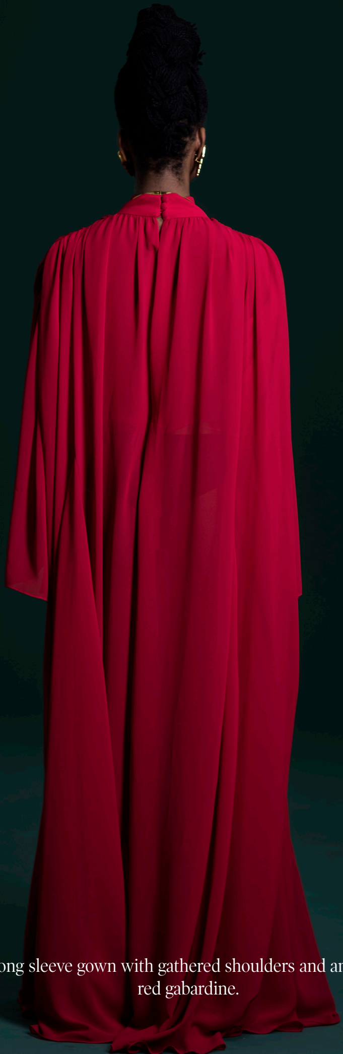
Two-tiered long sleeve gown with gathered shoulders and ample hemline, in red gabardine.