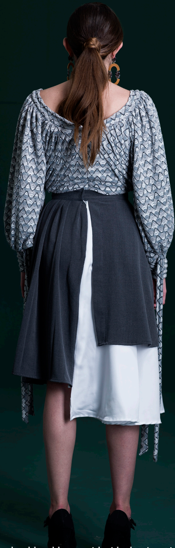
Off-the-shoulders blouse with side drapings, in grayscale knit. Three-tiered asymmetrical skirt, in gray melange gabardine and white poplin.