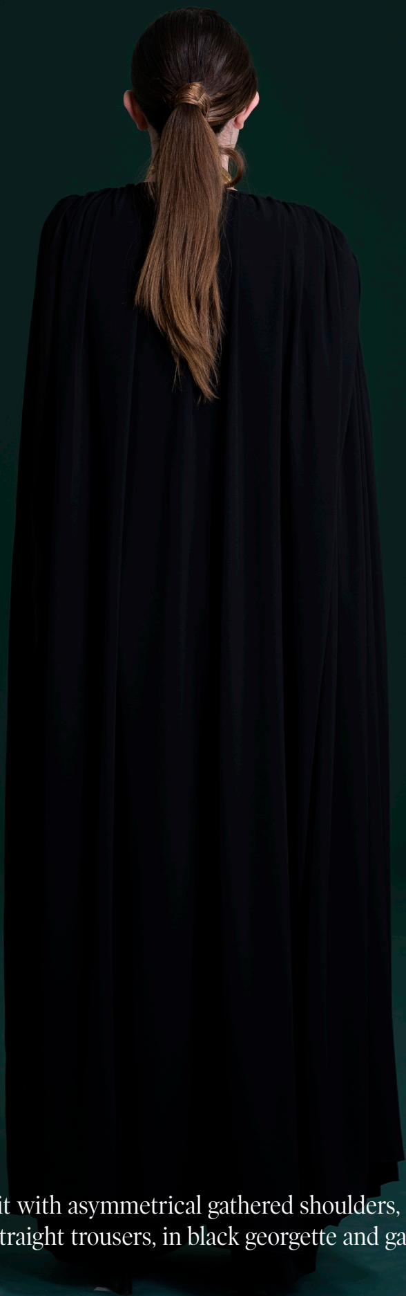
Caped jumpsuit with asymmetrical gathered shoulders, rounded neckline and straight trousers, in black georgette and gabardine.