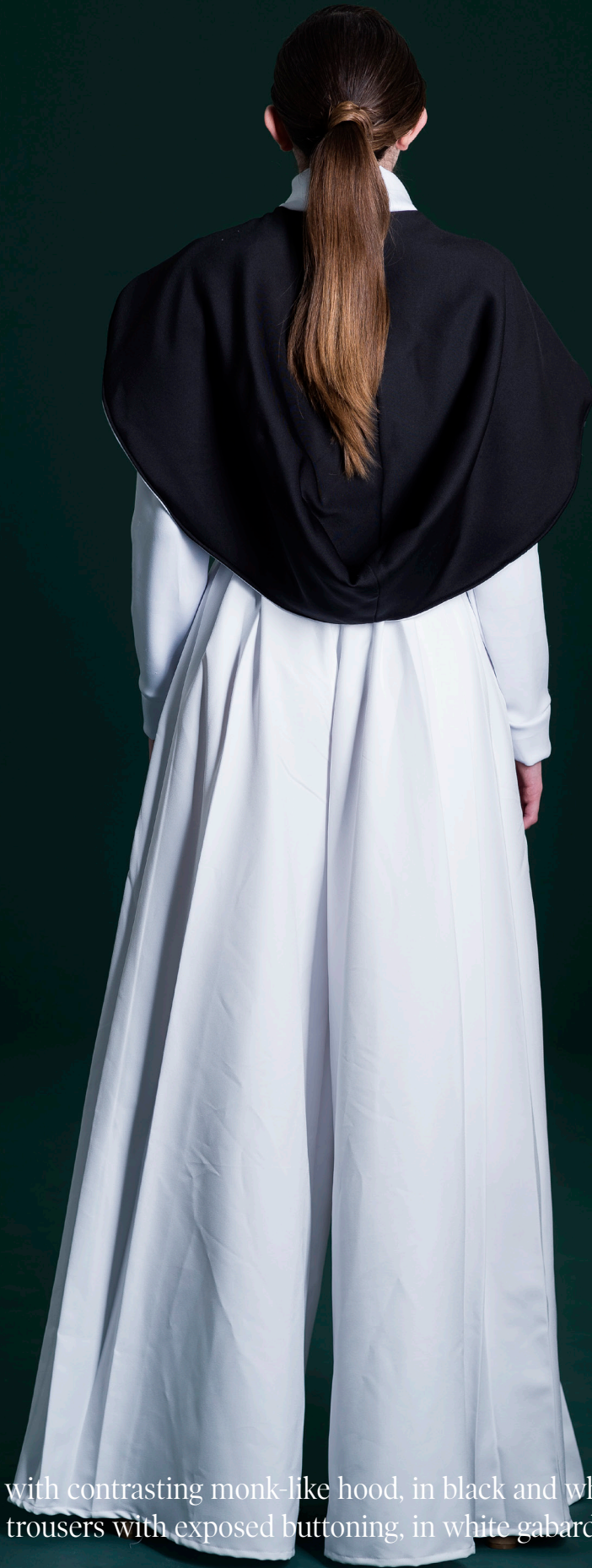
Kimono sweater with contrasting monk-like hood, in black and white neoprene. Pleated trousers with exposed buttoning, in white gabardine.