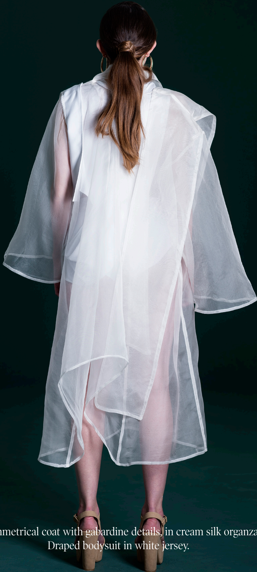
Asymmetrical coat with gabardine details, in cream silk organza. Draped bodysuit in white jersey.