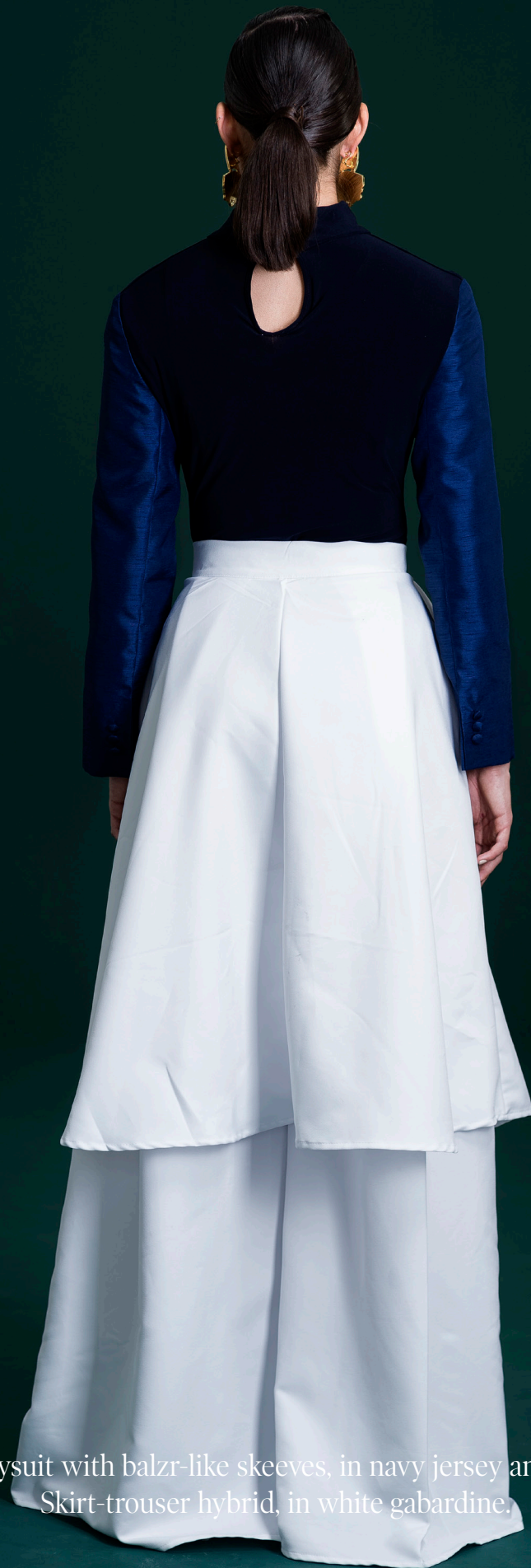
Fitted bodysuit with balzr-like sleeves, in navy jersey and shantung. Skirt-trouser hybrid, in white gabardine.