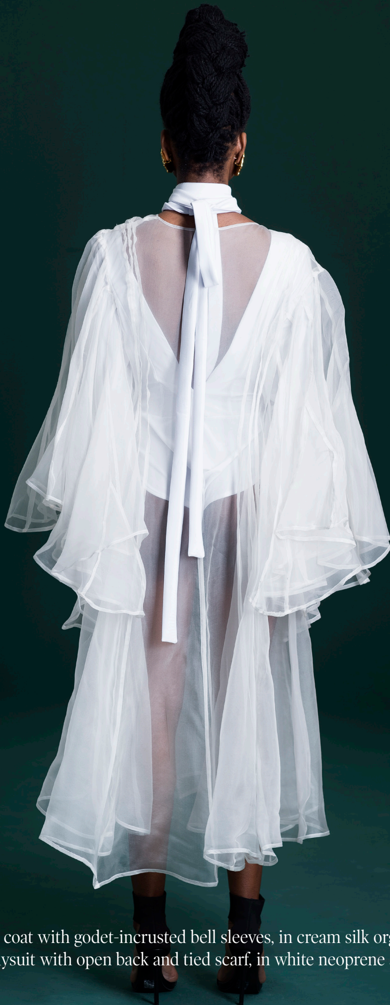
Open coat with godet-incrusted bell sleeves, in cream silk organza. Fitted bodysuit with open back and tied scarf, in white neoprene and jersey.