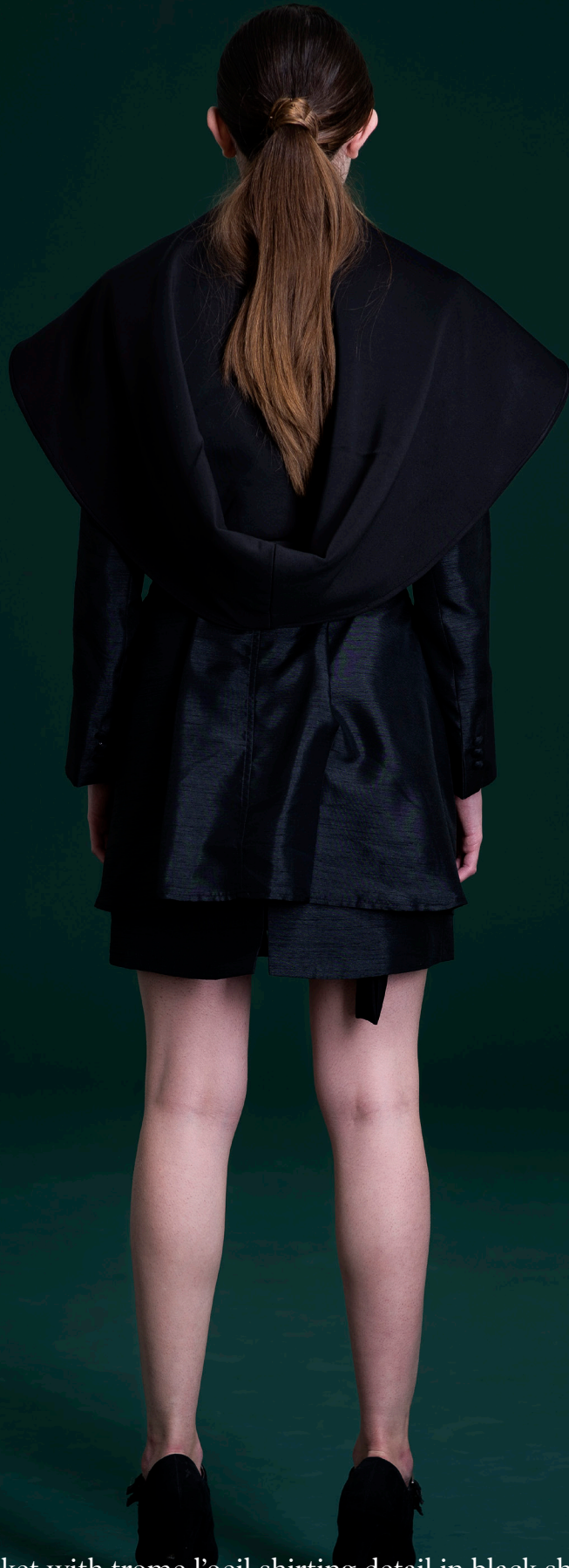
Blazer jacket with trompe l'oeil shirting detail in black shantung. Short bib tied at sides with monk-like hood, in black neoprene.