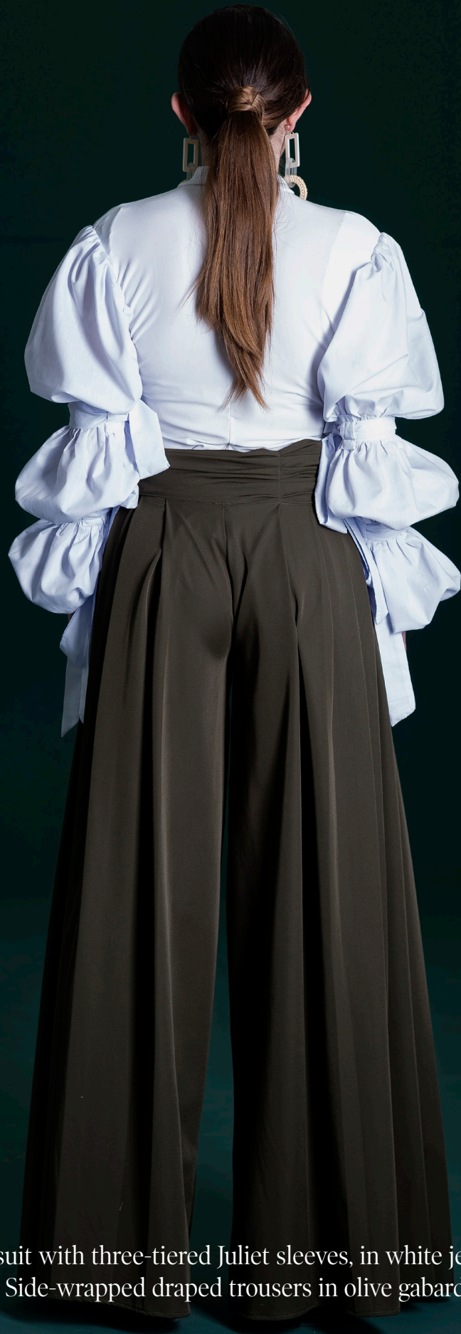
Fitted bodysuit with three-tiered Juliet sleeves, in white jersey and poplin. Side-wrapped draped trousers in olive gabardine.