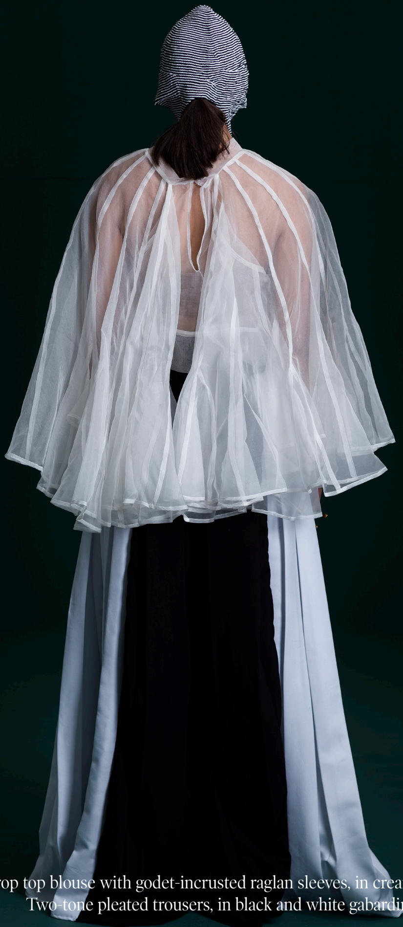
Loose crop top blouse with godet-incrusted raglan sleeves, in cream silk organza. Two-tone pleated trousers, in black and white gabardine.