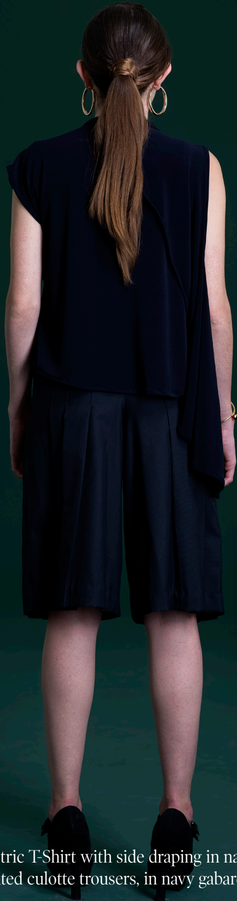
Asymmetric T-Shirt with side draping in navy jersey. Pleated culotte trousers, in navy gabardine.