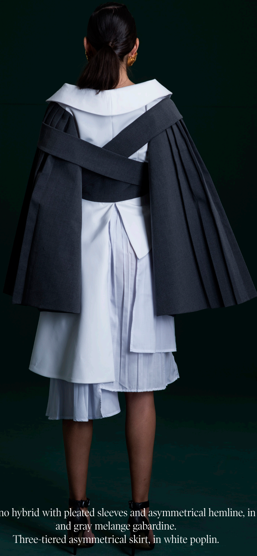
Shirt/Kimono hybrid with pleated sleeves and asymmetrical hemline, in white and gray melange gabardine. Three-tiered asymmetrical skirt, in white poplin.