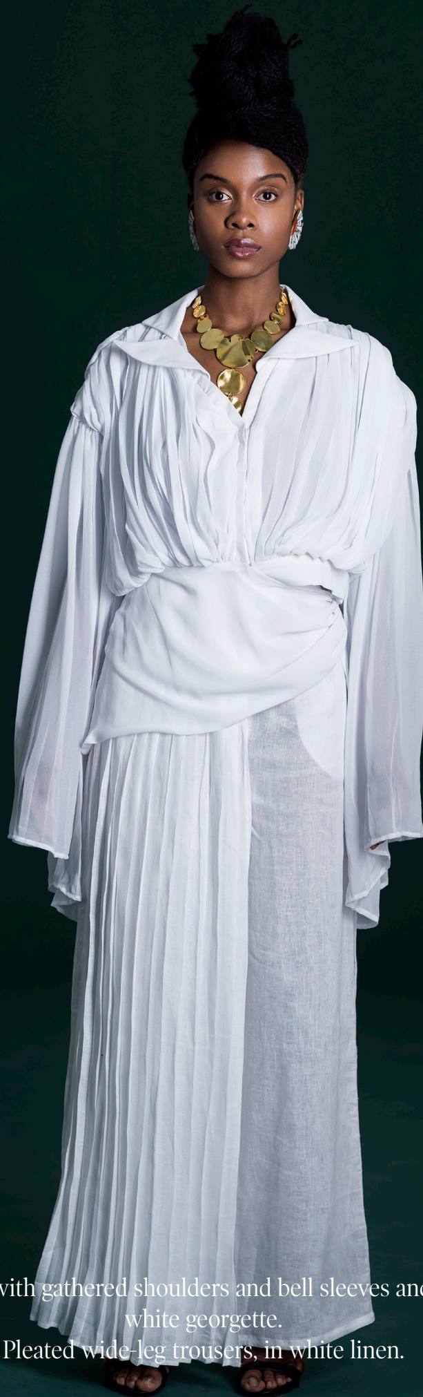
Pirate-style shirt with gathered shoulders and bell sleeves and draped sash, in white georgette. Pleated wide-leg trousers, in white linen.